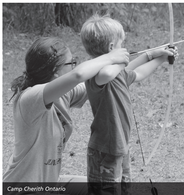
Camp Cherith Ontario

hand-washing facility: A supply of soap and fresh water, suitable for washing. It does not necessarily imply running water and may include the availability of waterless hand sanitization products.